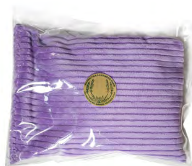
Mini Lavender Heat Pack $17.50ea