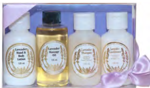
Lavender Travel Pack $51.00ea