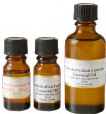
Lavender Essential Oil From only $21.50 for 12ml

Searching for a gift that is perfect for anyone? Well take a look at these gorgeous sets that everyone will love! Why not even grab a couple to set aside just in case you forget to buy for someone who arrives unexpectedly!