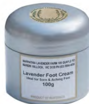
Lavender Foot Cream $19.50