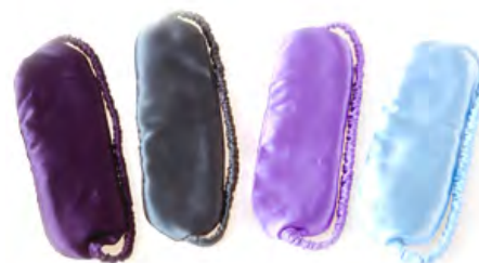
Lavender Eye Pillows $27.00ea