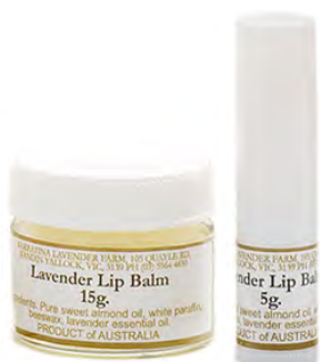
Lavender Lip Balm 5g stick $6.00ea & 15g $11.50