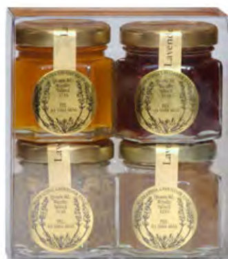
Mini Culinary Pack $21.00ea