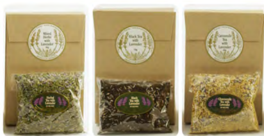
Lavender Teas From $9.00 for 20g bags