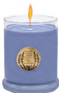
Lavender Soy Wax Candle 40 Hour $25.50ea