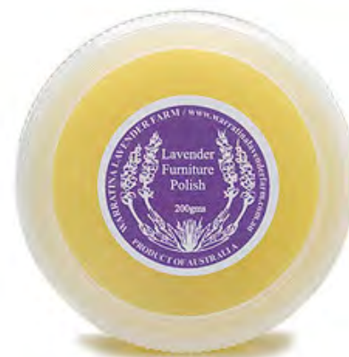
Lavender Furniture Polish $21.50ea