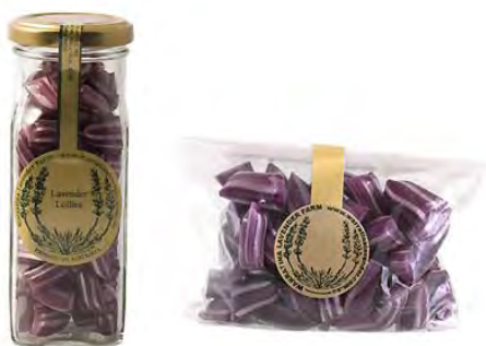
Lavender Lollies 100g pack $6.00ea or 175g Jar $10.50ea