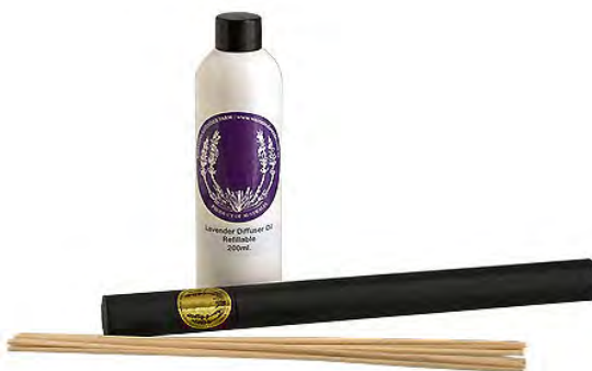
Lavender Diffuser Oil & Reeds $25.00 oil & $5.50 reeds